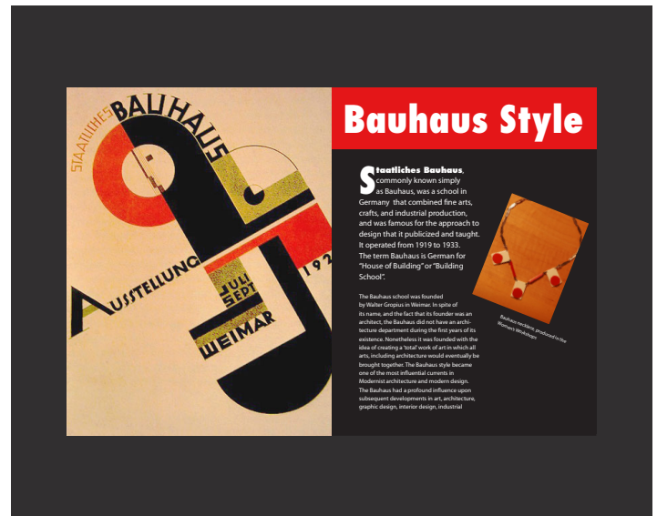
Final magazine spread presented on 20" x 16" black board with tissue indicating grid