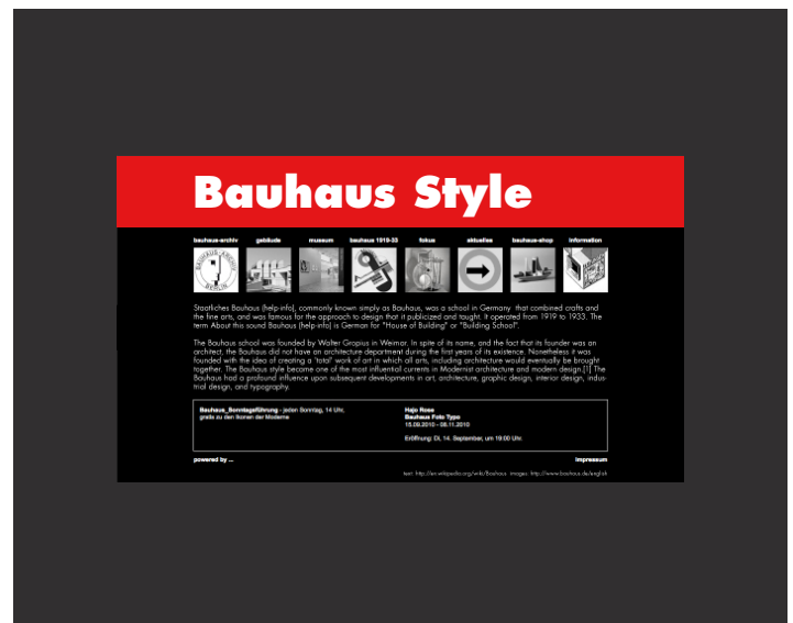
Final web page presented on 15.25" x 13.5" black board with tissue indicating grid