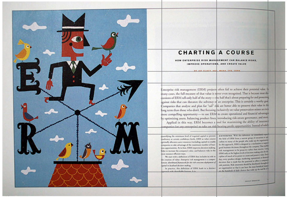
Sample magazine layout

When you present, you will be asked questions about the history of the style you picked.